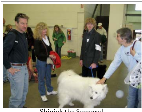
Shiniuk the Samoyed