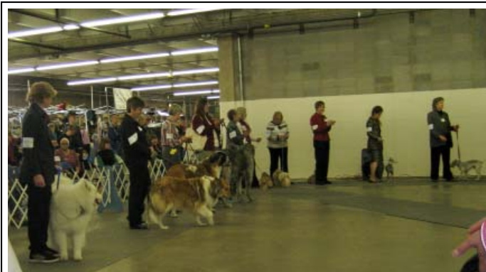
Parade Line Up