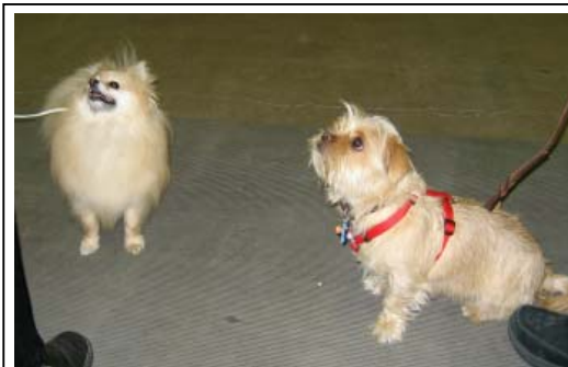
Tinker and Shadow

injury was so inspiring that she was featured on Channel 2 at the Parade "for quite a few minutes," according to her proud Clemens Family. Next came "Moses," a "glorious, sweet Collie boy" who, due to a seizure episode that entirely stopped his brain activity, had to re-learn all things necessary for him to survive.