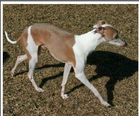
Italian Greyhound, Grumpy