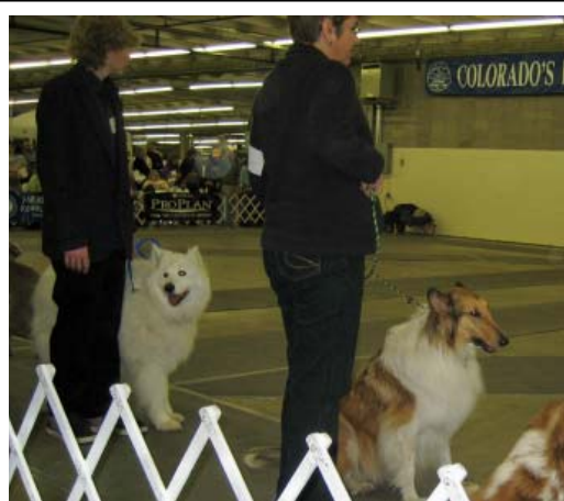
Shiniuk and Moses