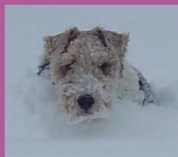
Wire Fox Terrier, Ozzie