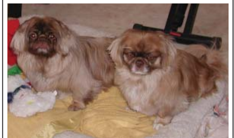
Chip and Dale